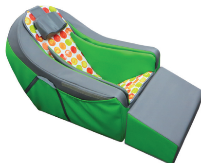
Snooza with Leg Rest