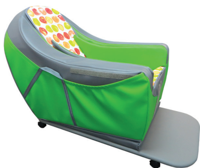
Snooza with Mobile Base